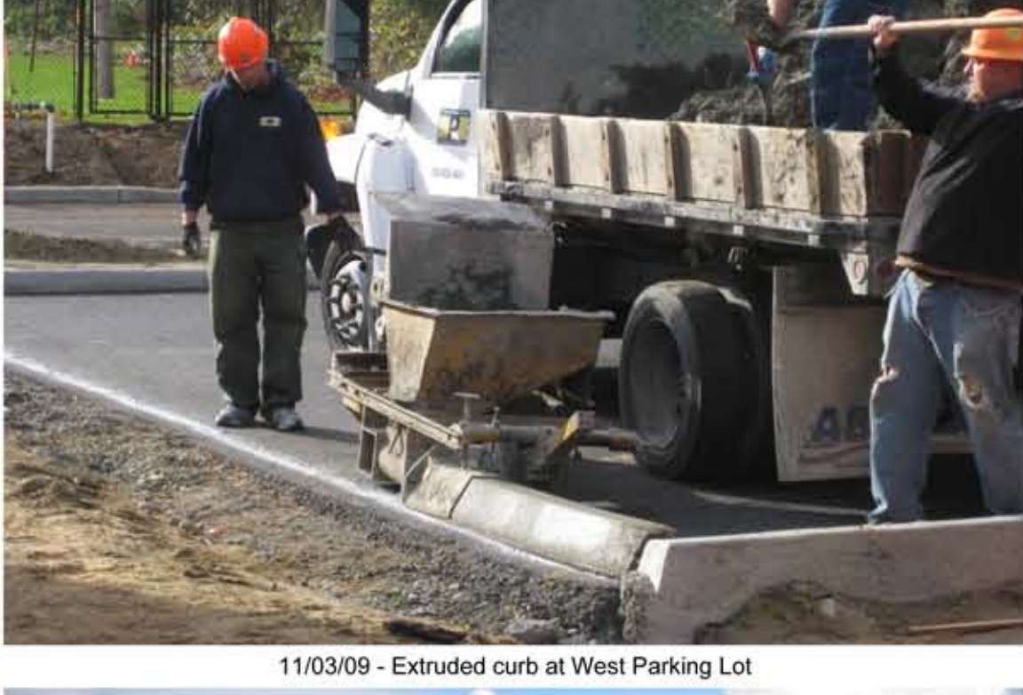
11/03/09 - Extruded curb at West Parking Lot