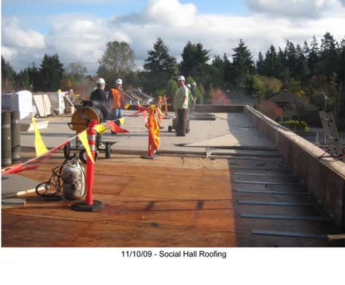
11/10/09 - Social Hall Roofing