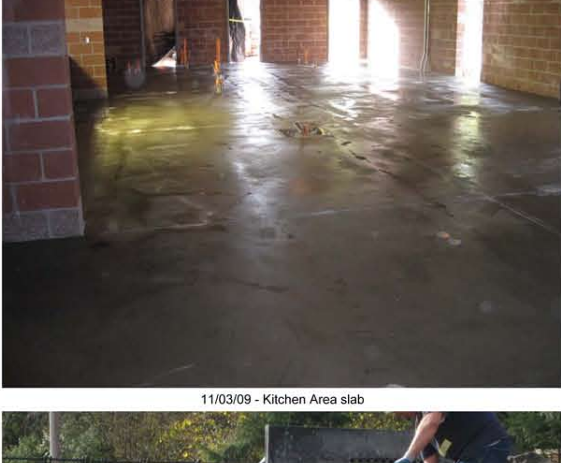
11/03/09 - Kitchen Area slab