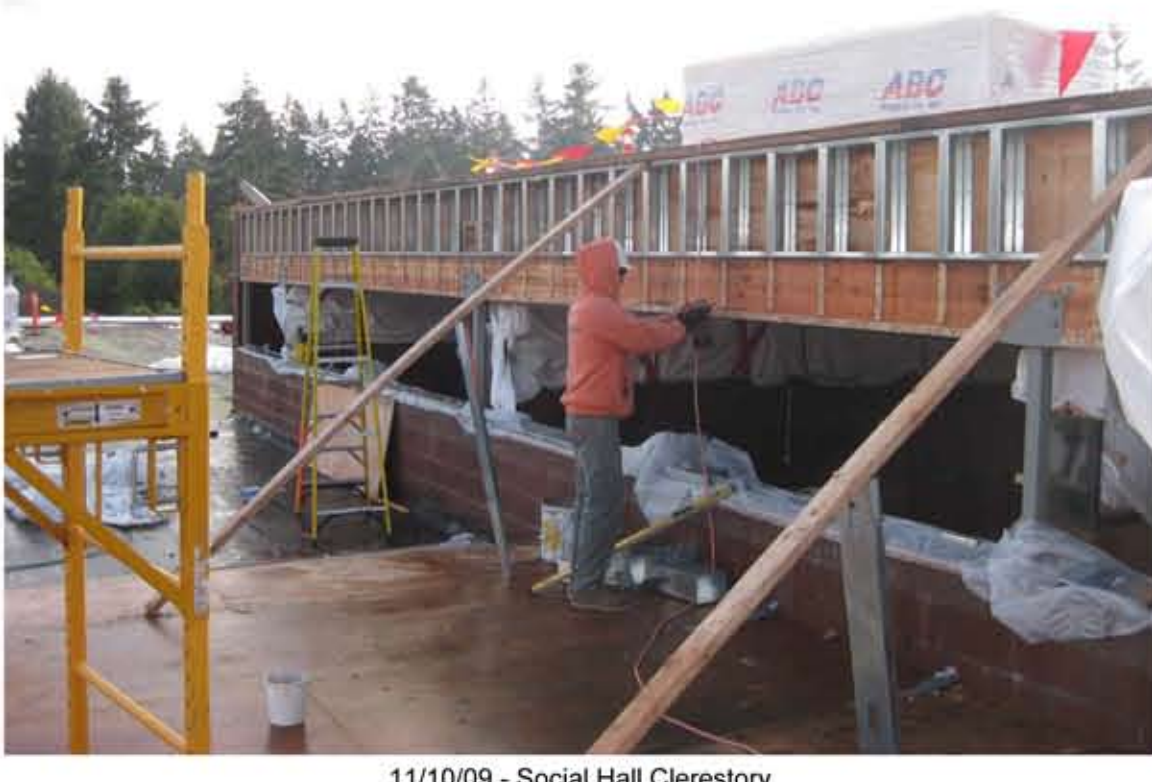
11/10/09 - Social Hall Clerestory