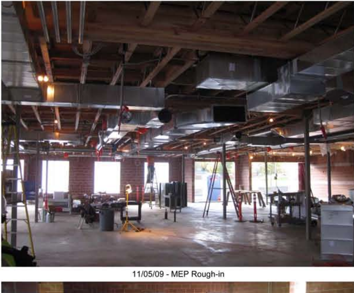
11/05/09 - MEP Rough-in