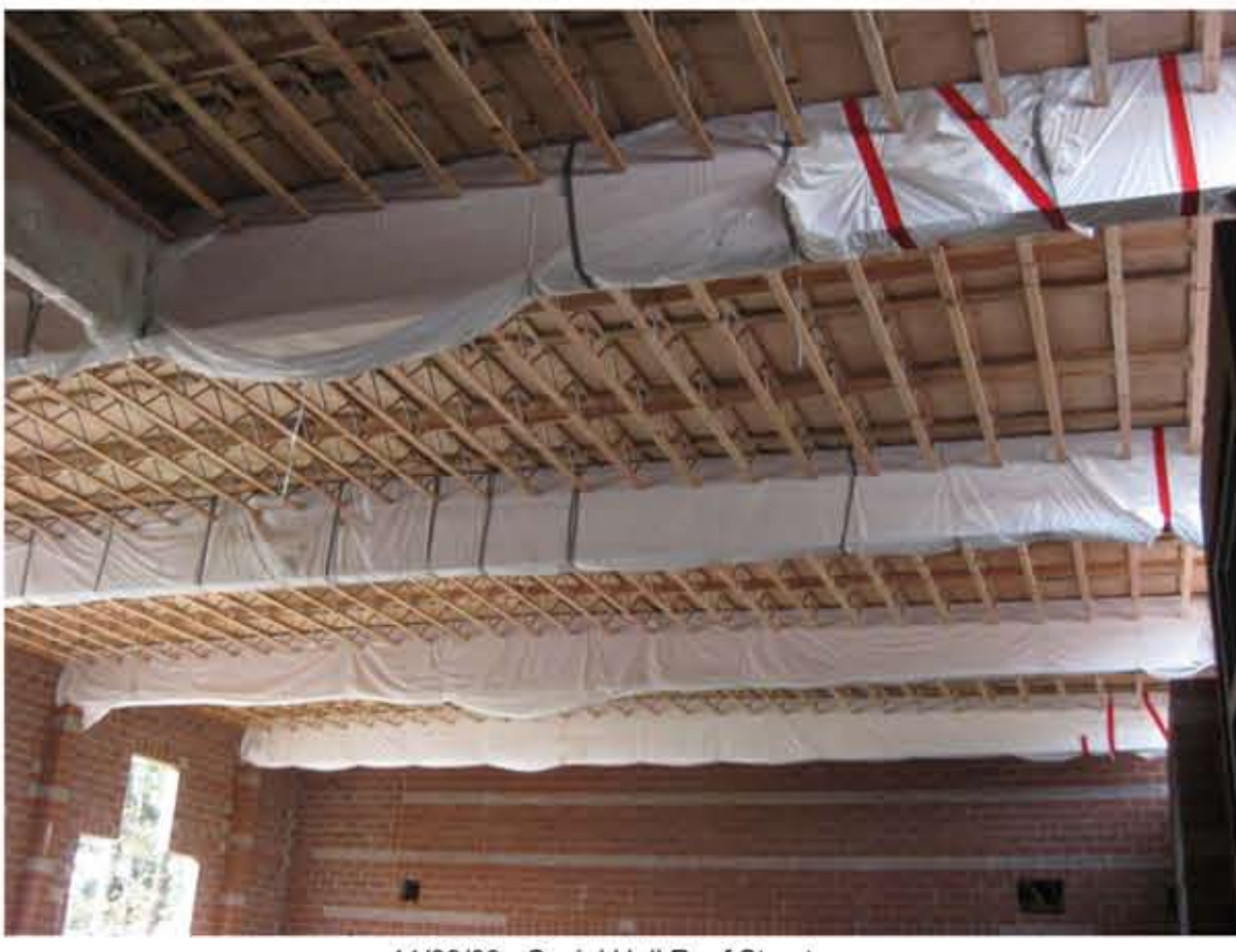
11/03/09 - Social Hall Roof Structure