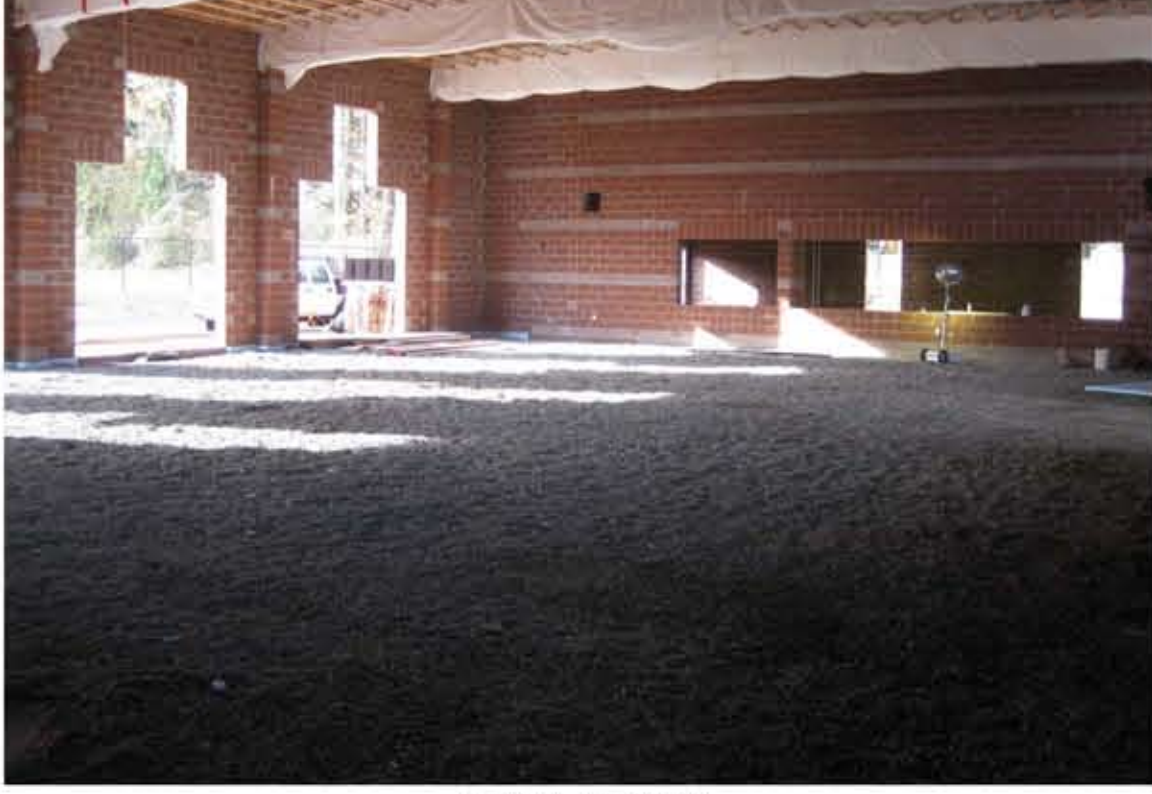
11/03/09 - Social Hall

The roof structure is complete and installation of the roofing is taking place during every dry day available. We will take advantage of the weather tomorrow and finish up the roofing on the Social Hall. The Office area was recently tented on the outside so we can finish cleaning and sealing the CMU. In the interior, we continue the mechanical, electrical, and plumbing rough-in.