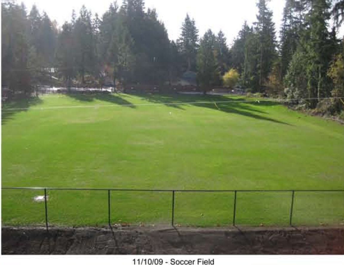
11/10/09 - Soccer Field